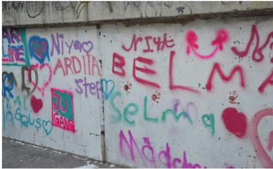
Illustration 5: The making of the wall vis-a-vis the girls' garden, Simmering, Vienna

The Austrian team (Haidinger, 2015) concluded that, artistic practice “of the moment, belonging to a pedagogy of the here-and-now” (Batsleer 2011, 428) such as street-art can motivate voices of girls. New ideas and finally whole oeuvres emerged through an artistic process starting from a self-perception of many girls not being capable of drawing.