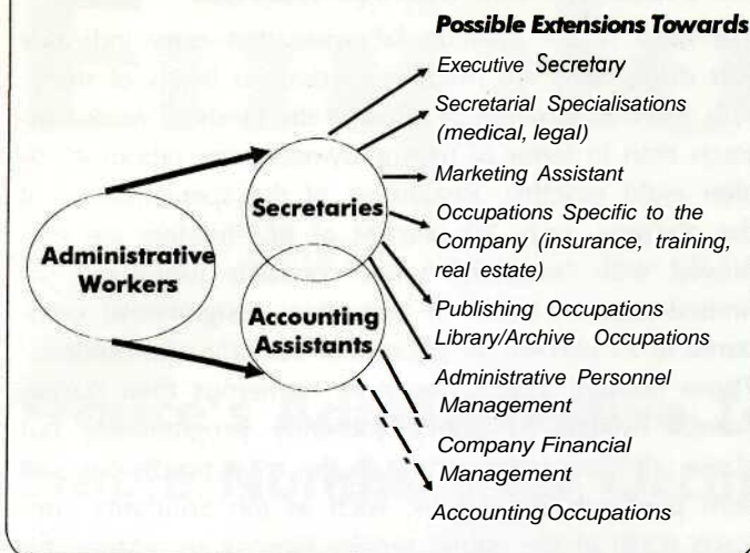
Diagram 1: Basic Occupations in the Administrative Service Sector and Possible Individual Career Paths

ment in activities particular to the company, which manifests itself in closer relations with the professionals they assist. Accounting assistants , meanwhile, have to be more open to their environment and combine the rigour of their field with a flexible behaviour that allows them to gather information in less standardised situations and provide frequent explanations of what they are doing. There is also an increasingly important body of competences common to the two specialisations: inter-personal approaches, preparatory accounting work, handling of files or contracts (see Diagram 1). Secretaries are now twice as numerous as accounting assistants (724,000 "accounting and financial services workers" compared with 320,000 in 1990; see Diagram 2), owing to a much greater increase among the former at a time when the latter were stabilizing. Finally, while it is well known that the occupation of secretary remains exclusively female, that of accounting assistants is moving in that direction, with fewer and fewer numbers of men (16 % in 1990).