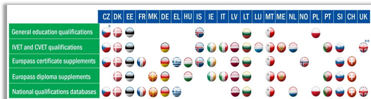
Figure 1. Including NQF/EQF levels in qualifications documents and/or databases

Several countries have indicated their intention to do so in 2017: Austria, Belgium-fl and Belgium-fr, Bulgaria, Finland and Turkey. Countries such as Denmark, Estonia, Lithuania and Malta have included references to NQF/EQF levels in all their qualifications documents; Finland is signalling its intention to do so after completing referencing in 2017.