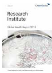
Global Wealth Report 2018 October 2018