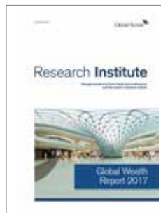
Global Wealth Report 2017 November 2017