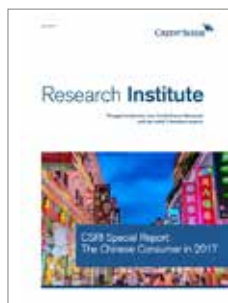
CSRI Special Report: The Chinese Consumer in 2017 April 2017