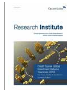
Summary Edition: CS Global Investment Returns Yearbook 2018 February 2018