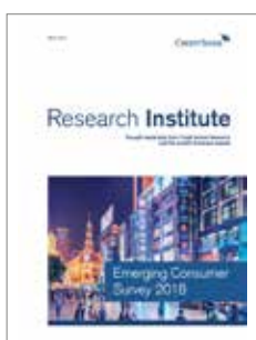
Emerging Consumer Survey 2018 March 2018