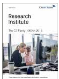
The CS Family 1000 in 2018 September 2018