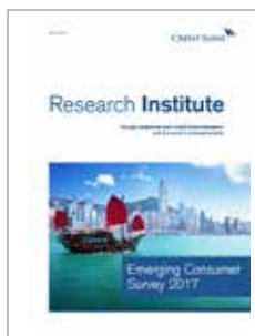
Emerging Consumer Survey 2017 March 2017