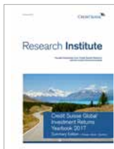
CS Global Investment Returns Yearbook 2017 February 2017