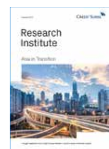
Asia in Transition November 2018