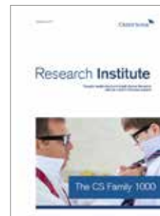
The CS Family 1000 September 2017