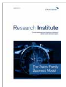
The Swiss Family Business Model September 2017