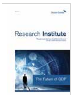
The Future of GDP May 2018