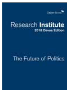
The Future of Politics – Davos edition January 2018