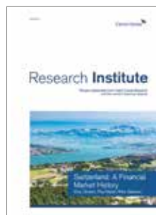
Switzerland: A Financial Market History June 2017