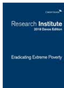
Eradicating Extreme Poverty – Davos edition January 2018